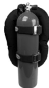
Fig. 10: Correct strap position on single cylinder