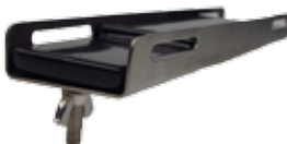
Fig. 9: Placement of the 6-lb. Convertible Weight inside the STA Channel