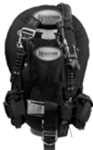
Fig. 8: Assembled Eclipse BC System with accessories.