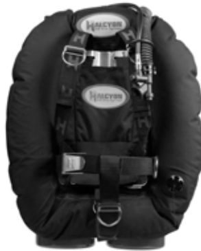
Figure 11. Evolve double BC System

WARNING: Halcyon BC wings are specifically designed for either single or double cylinders. Always use the appropriate wing for the designated cylinder type(s). Failure to use the appropriate amount of lift for a given cylinder configuration can result in negative buoyancy, which could lead to serious injury or death. Always test your fully rigged and weighted BC system in a controlled environment such as a pool before attempting a dive.