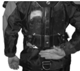
Fig. 7: Rear D-ring placement