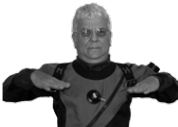
Fig. 5: Locating the proper location for the chest D-rings

The front crotch D-ring is only used with a tow-behind scooter. Gear should never be clipped to this D-ring, as it will hang in the slipstream and pose significant entanglement hazards.