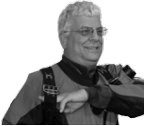
Fig. 3: Allow for at least two fingers of spacing between the harness strap and your exposure suit.