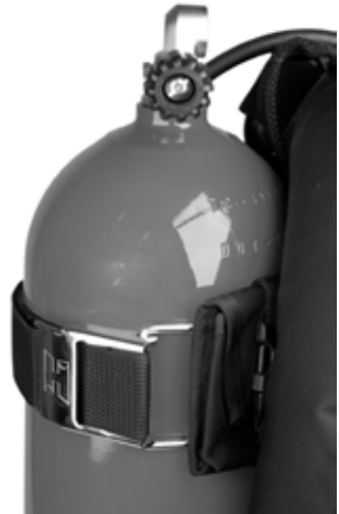
Fig 58: Halcyon Trim Weight placement