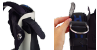
Fig. 49 - 50