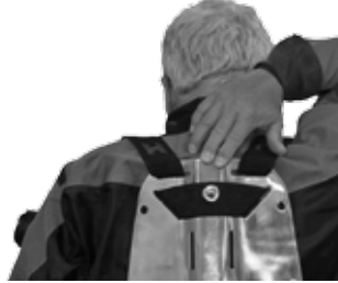
Fig. 4: Proper placement of backplate

The crotch strap should be comfortable and allow you to reach your tanks. The waist belt should fit as snug as is comfortable. Do not overtighten the waist belt so much as to restrict breathing. When adjusting the waist belt, make sure to set the buckle so that it is off to your right side. With the buckle in this position, the crotch strap is unable to accidentally open the buckle. The waist belt buckle (and/or another buckle) can be used to hold your Explorer light canister in place.