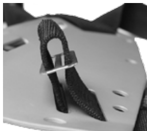
Fig. 2: Adjusting rear triglide fastener