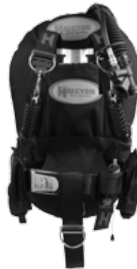
Figure 12. Assembled Eclipse BC with Scout lights and knife.