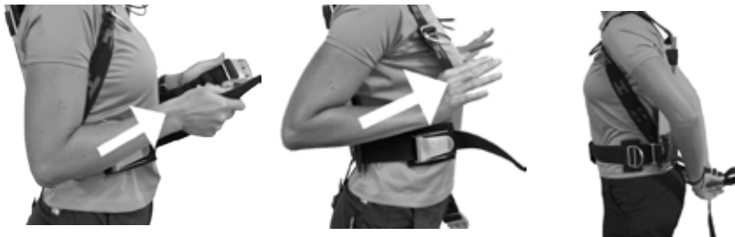
Fig. 13, 14, 16

A triglide may be put into place to act as a sizing guide to prevent overtightening the harness. Figure 15 shows the optional triglide placement to prevent overtightening. Right is pictured without.