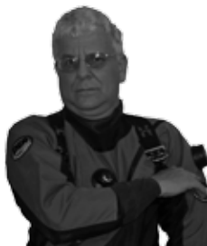
Fig. 6: Checking final placement of the chest D-ring