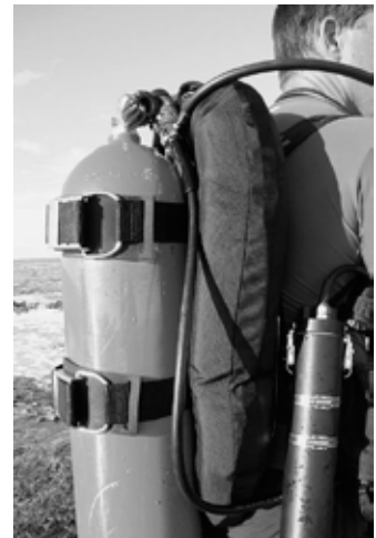
Diving an Eclipse Single Tank BC System

Explorer and Evolve wings should not be used in any single-cylinder configuration.