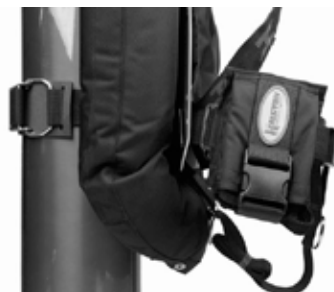
Fig. 54: ACB20 Integrated weight pocket, mounted on Secure Harness waist belt

For example, an Eclipse system might be configured with a combination of releasable and fixed ballast. Six pounds (3 kg) of fixed ballast are accounted for with the Halcyon stainless-steel backplate. You may also adjust non-releasable weighting by choosing Halcyon's aluminum backplate or the weighted Halcyon Single Tank Adapter (6 lb/2.7 kg) (fig. 56). An additional two to ten pounds (1-4 kg) can be positioned directly on your tank using Halcyon's Trim Weight pockets (fig. 57-58). When properly configured and tested, tank trim weighting may assist in facilitating a heads-up position while at the surface. However, you should not consider the BC system as a replacement for a life jacket; it is not designed to function in this capacity. Proper placement of tank-mounted Halcyon Trim Weights also promotes stable and consistent horizontal trim during the dive. The remainder of the necessary weighting can be fine-tuned through the use of Halcyon's ACB integrated weight system, configurable with up to 20 pounds (9 kg) of releasable weight.