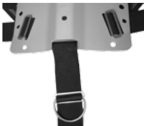
Fig. 1: Rear view of crotch strap triglides

To finalize the fit of the harness shoulder straps, loosen the straps enough to allow easy movement of the backplate. Position the backplate for proper tank position, with the top of the backplate high enough to touch by reaching behind your head with either hand; if you can touch the backplate, you should be able to reach your valves when your rig is fully assembled (figure 4). With the backplate in position, tighten up the arm straps until you are able to fit two or three fingers underneath the strap. You should be able to easily slide the straps off of either shoulder. Be careful not to leave excessive slack in the harness straps. An exceedingly loose-fitting harness will allow the backplate to ride low on your back, making it nearly impossible to reach your valves.