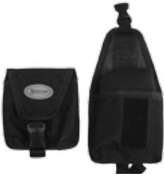
Fig 57: Use of soft weights with the Trim Weight Kit