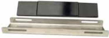
Fig 56: Single Tank Adapter weight insert, and Stainless Steel STA channel.