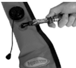
Fig. 53: No-Lock Inflator

The optional BC Storage Pak (fig. 52) provides stealth storage for alternate lift and signaling devices. Storing devices in the Pak eliminates the possibility of accidental damage or entanglement on land, in a boat, or in the water. The Storage Pak bolts onto your rigged Secure Harness backplate with the eight supplied bolts. Alternate lift devices are carried in the Pak folded flat, with the snap connected to the left waist D-ring. To deploy the device, simply detach the bolt snap with your left hand and then pull down and to the left. Once the device has cleared the Pak it can be inflated using the low-pressure hose from your BC inflator or by using a low-pressure hose connected to a separate air source such as a dry suit inflator (fig. 53).