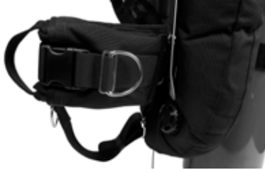
Fig. 55: ACB20 Integrated weight pocket, mounted on Secure Harness waist belt.