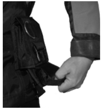
Fig. 59 - 61: ACB weight pocket release